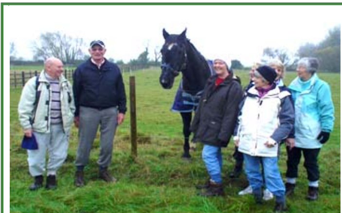
Recruiting a New Member

views across to Bardney and the sugar plant. We followed the dyke taking us through the small hamlet of Wasps Nest and came upon a tree trunk with carvings of numerous animals including otter, pheasant, duck, and squirrel; a rare sight which must have taken many hours to complete. As we continued on our circular route we stopped for a chat and